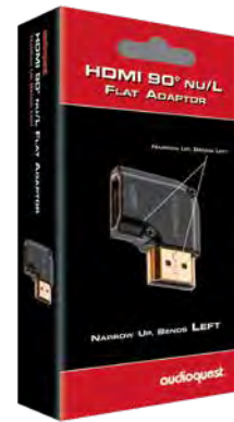
HDMI 90° NU/L Flat Adaptor