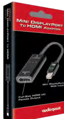
Mini Display Port to HDMI 4K Adaptor