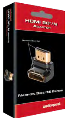
HDMI 90°/N Adaptor