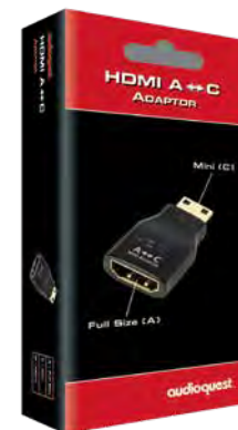
HDMI A ↔ C Adaptor