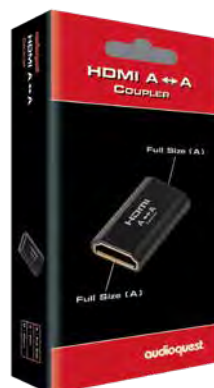
HDMI A ↔ A Coupler