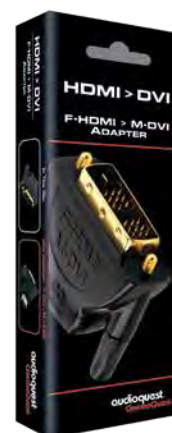
HDMI-IN > DVI-OUT Adaptor