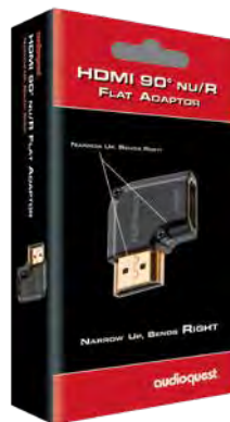
HDMI 90° NU/R Flat Adaptor