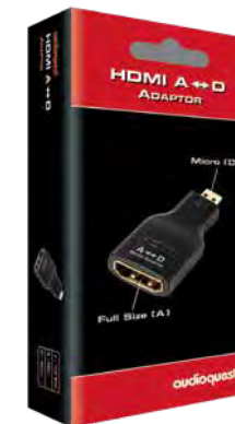
HDMI A ↔ D Adaptor