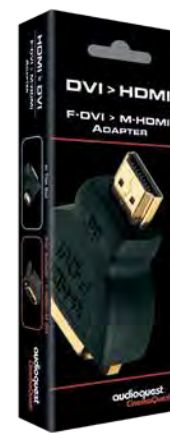
DVI-IN > HDMI-OUT Adaptor