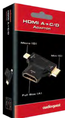
HDMI A → C/D Adaptor

Standard [Type A] to Mini [C] and Micro [D]